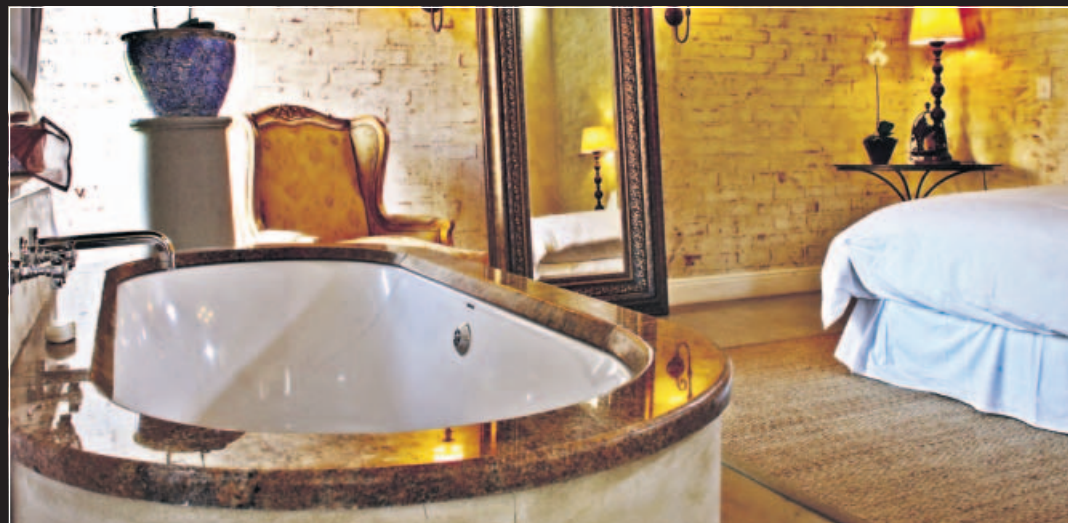
SHEER LUXURY: At Avianto Village Hotel, you take a bath in your bedroom – and what a fine experience it is!

■ Boitumelo Tlhoale was an invited guest of the Dstv and Steelwings weekend road trip.