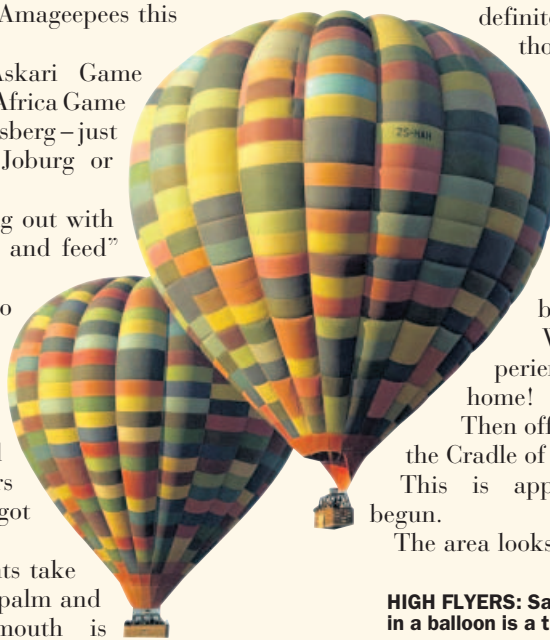
HIGH FLYERS: Sailing through the sky in a balloon is a truly serene adventure

Having the elephants take an orange from your palm and then from your mouth is